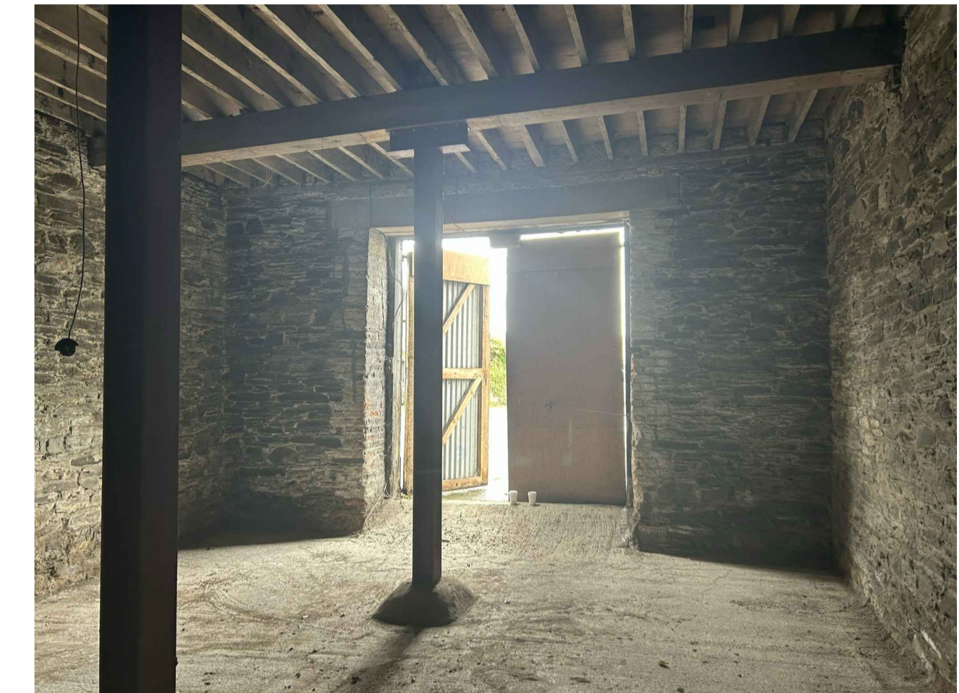
03 Image of Existing Door Ope of Intervention 04 Scale: 1:20